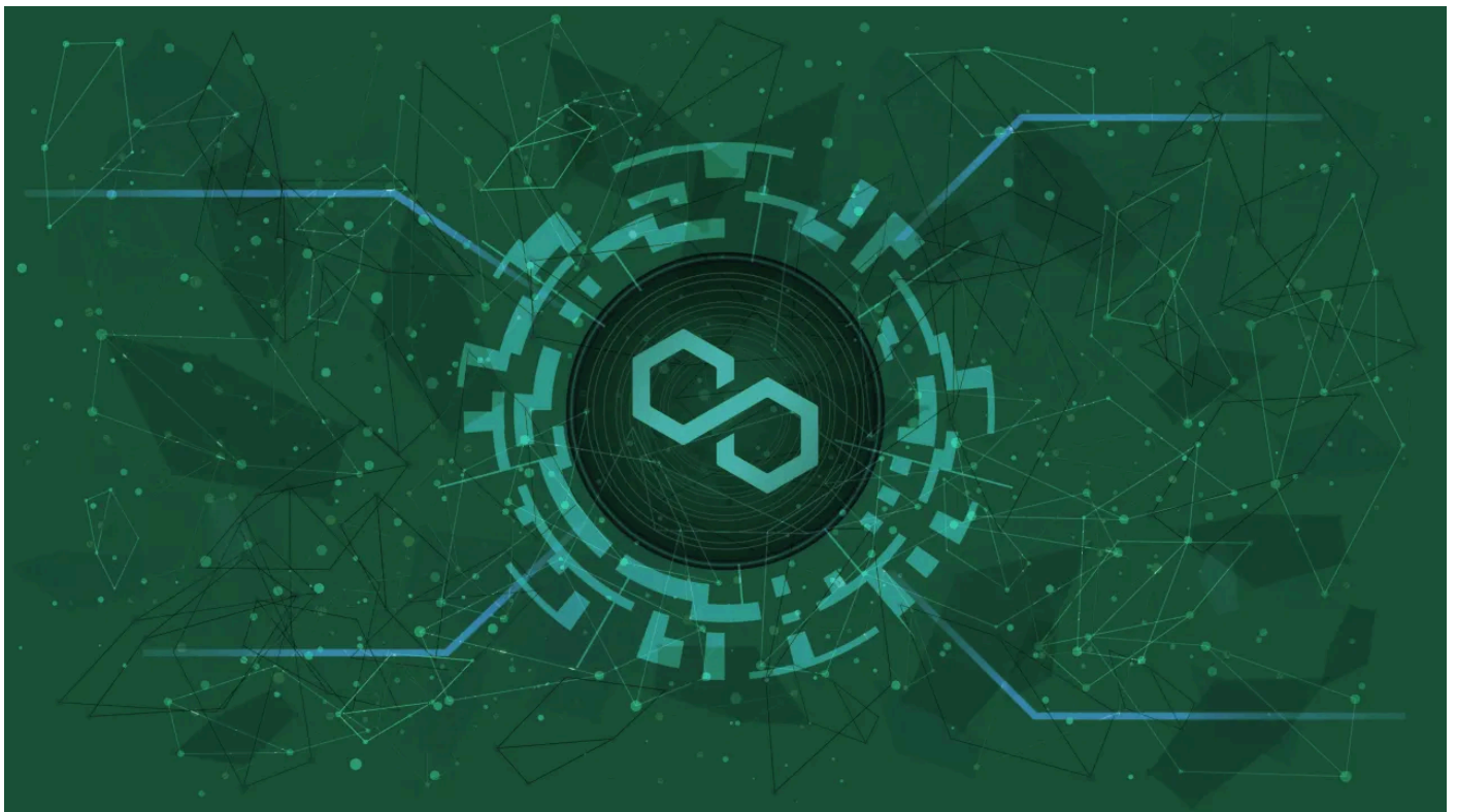
Polygon is a layer 2 scaling solution for Ethereum.